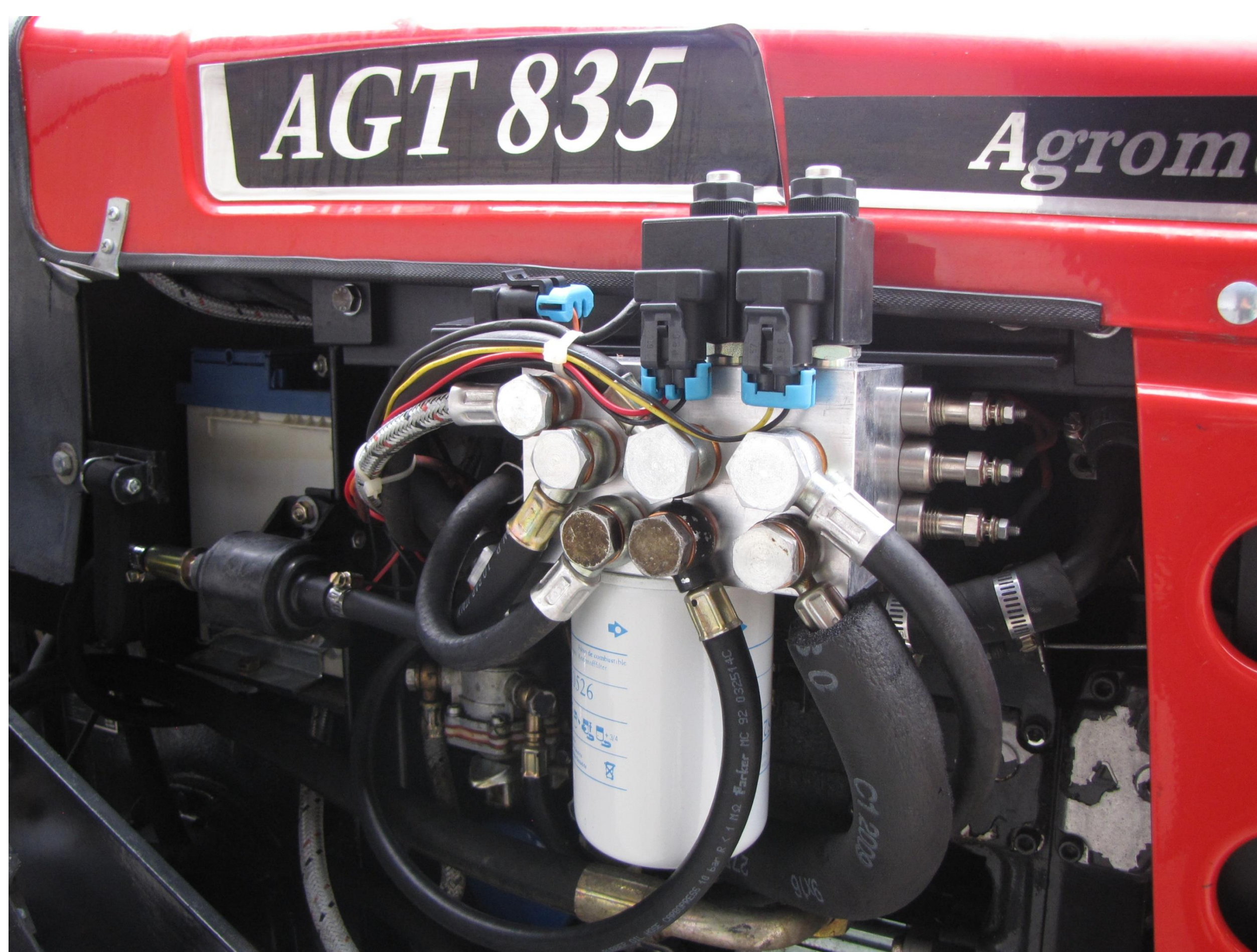
AIS – OIL COMPACT built-in on tractor.

AIS OIL COMPACT is a two tank system. The existing tank is for mineral diesel fuel D2, and additional tank is for vegetable oil or vice-versa.