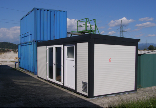
Picture: Biomethane modular unit (number 6 ) – container with adsorbent vessels (Pressure Swing Adsorption – PSA) and computer controlled electronic measuring system for continuously measuring physical and chemical properties of biogas and biomethane

Field of use: Renewable energy sources Current state of technology: Fully developed product (TRL 9) Inventors: JEJČIČ Viktor (Agricultural Institute of Slovenia), ŠKRJANEC Igor (Omega Air d.o.o.) and SOJER Edvard (Omega Air d.o.o.)