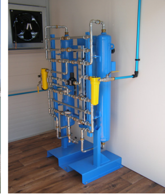
Picture: Micro adsorbent vessels for cleaning and upgrading of raw biogas to biomethane phase